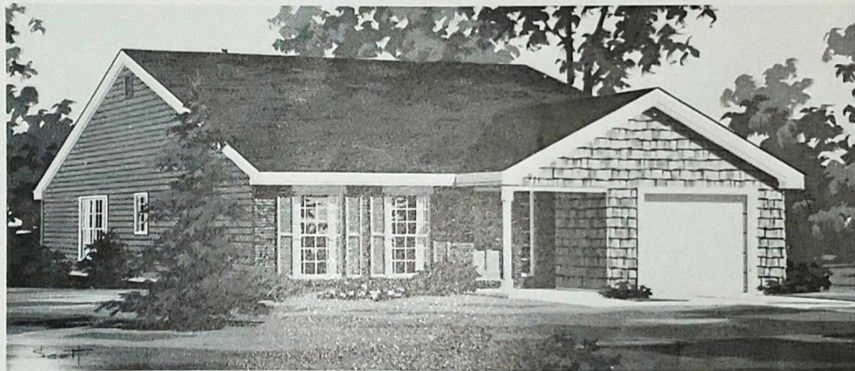
Exterior Elevation Series B