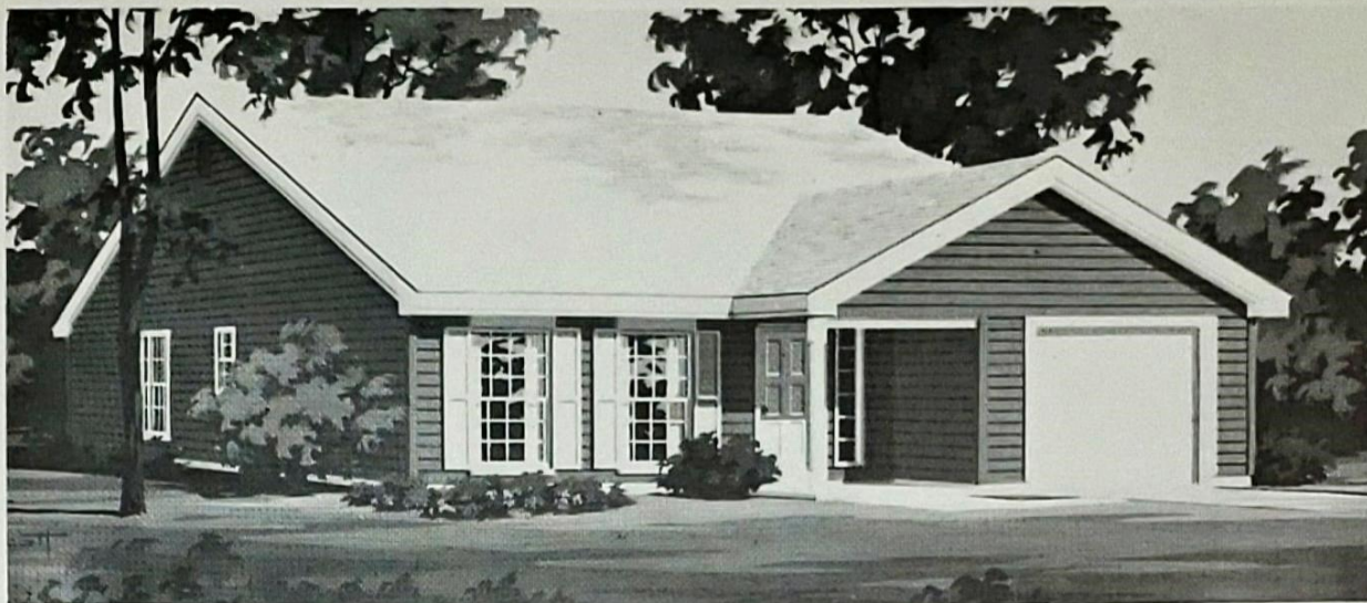
Exterior Elevation Series A